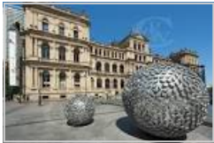
Reddacliffe Place facing Treasury Casino by Day