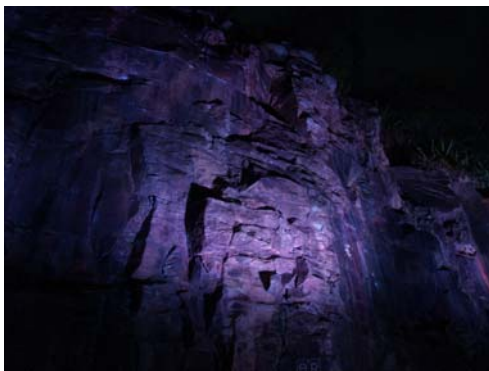
Kangaroo Point Cliffs

The EAPU has been fortunate to receive support from the Brisbane City Council to raise awareness of elder abuse around the city. This is the second year that Brisbane will change the lights purple to commemorate WEAAD. Some sights in Brisbane turning purple include Kurilpa Bridge, Treasury Casino and King George Square; and in Cairns the Cairns Reef Casino, Cairns Library and Lake Street.