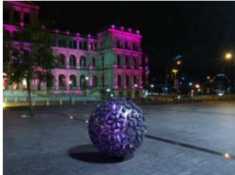
Reddacliffe Place facing Treasury Casino for WEAAD