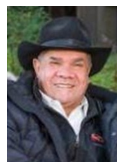
Prof Mick Dodson AM