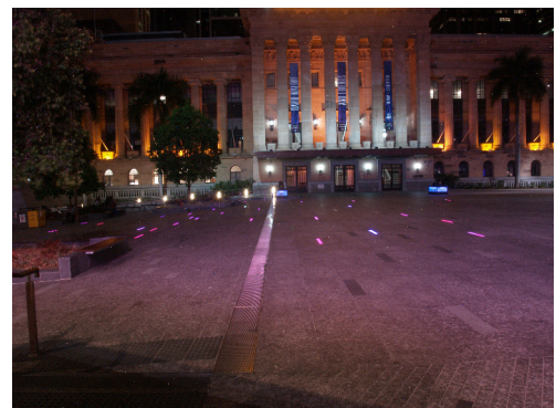
King George Square