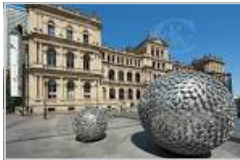
Reddacliffe Place facing Treasury Casino by Day